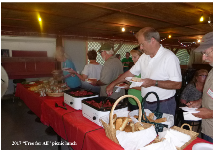
2017 "Free for All" picnic lunch

The annual meeting and picnic provide the opportunity to meet the board members and lake representatives. The board and lake reps welcome your input and ideas. Drive your car, walk, ride a bike or come by boat to the Annual CCROA Meeting and stay for the "Free for All" picnic!!