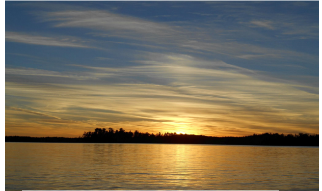
Sunset on the Cisco Chain

Let's look at the REASON for buying the Dam. Our need for the Dam is simple- make the Cisco Chain navigable. In other words, connect the 15 lakes so we can move from lake to lake. Without the Dam, we are essentially stuck on our own individual lake. This, of course, isn't a concern of UPPCO. Why would it be? It turns out, however, that this was a VERY big concern to the Dam's prior owner- the Marathon Mills Paper Company who sold the Dam to one of UPPCO's predecessor companies The Copper District Power Company in 1937. Marathon raised the level of the Cisco Chain expressly FOR navigation, so they could float logs around to the rail spur for removal. As it turns out, this has been done since approximately 1901 by a different company- the Brooks and Ross Lumber Company. All of this raising and navigating over nearly 40 years had created a "new normal" for the Cisco Chain- so much so that the requirement for maintaining this "new normal" was written right into the Warranty Deed when the Copper District Power Company bought the dam in 1937- requiring that the new owner "...maintain substantially the present water level of the water in said Cisco Lake and the Chain of Lakes connected hereto, insofar as it is physically possible to do so." It is here that we find UPPCO's obligation to maintain the