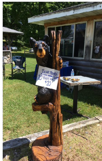
More picnic pictures are posted on the CCROA Website www.ciscochainroa.com

The 2019 CCROA Annual Meeting and Picnic are set for July 20, 2019!!!