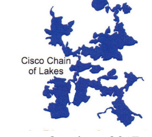
October, 2017 Volume Number 57 Issue 3

Fast forward to the present and we find an Association working hard to preserve and protect not only the natural resource that is the Cisco Chain but also the value of all of the properties situated here. From managing invasive species, to fish stocking, to securing the future water levels through the purchase of the Cisco Dam, we spend countless volunteer hours and an ever increasing amount of dollars to protect and enhance the Cisco Chain. Up to this point, we have met our financial needs through voluntary donations made by our generous members-- of which we are very thankful! Going forward, my genuine concern is our ability to